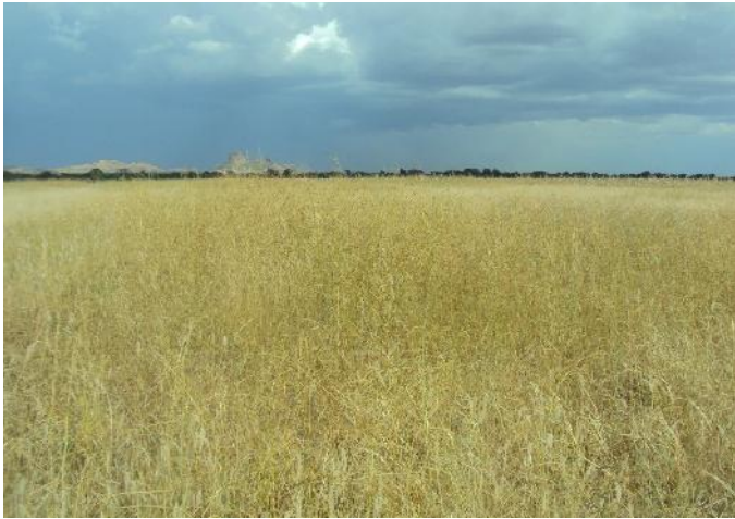
Plate 1: Jebel Kordofan