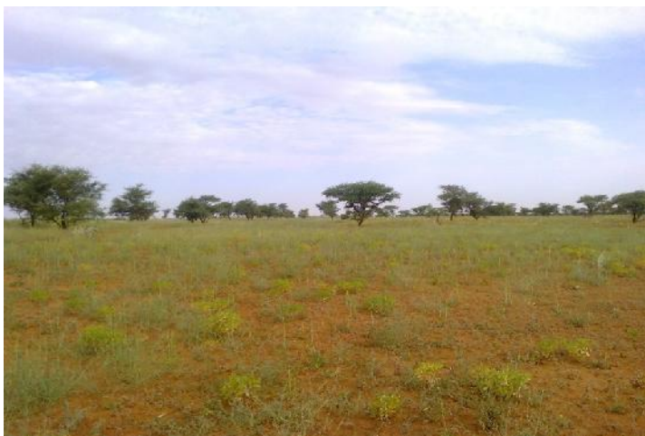
Plate 3: Demokeya