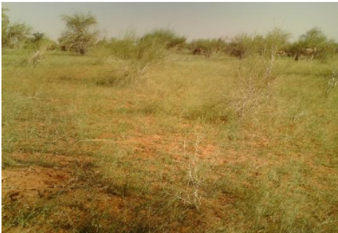
Plate 2: Um Glugi